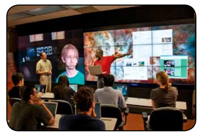
Photo of OptIPuter courtesy of the 2011 GLIF Brochure http://www.glif.is/publications/info/brochure.pdf.

In contrast to more general implementations of 100 Gbps services, which aggregate many millions of small traffic flows, this facility supports extremely large-capacity data flows, including a 98 Gbps data transfer between a single pair of high-performance servers with zero packet drops from the East Coast to Chicago and back (approximately 2,000 miles). The research consortium, whose members include NASA Goddard Space Flight Center, the International Center for Advanced Internet Research at Northwestern University (iCAIR), and the Laboratory for Advanced Computing at the University of Chicago (LAC), was established to investigate new networking techniques, technologies, and services for petascale science, with a focus on 100 Gbps end-to-end data flows, including disk-to-disk and memory-to-memory.