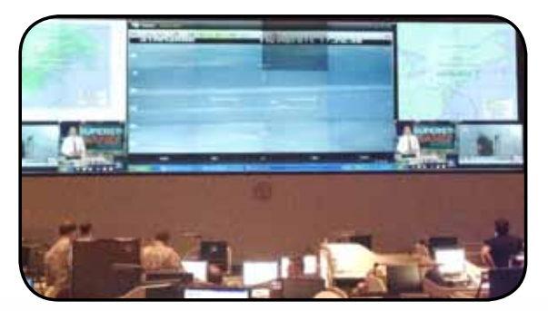
shows New Jersey Command Center during Hurricane Sandy making use of NJEDge's Vidyo service.

NJEDge collaborated with New Jersey Institute of Technology's (NJIT) Information Services and Technology division to build the foundation for a statewide community cloud that will provide cost-effective cloudbased infrastructure, platform and application services. NJEDge already provides a trusted broadband statewide network to over 50 members, mostly higher education institutions. NJIT has built a local cloud infrastructure and developed a set of robust and scalable provisioning and management processes based on VMware's virtualization offerings. By partnering and using VMware technology and several virtual organizations (vOrgs) established on NJIT's cloud infrastructure, multiple institutions are able to co-exist and operate separately and securely on the same hardware infrastructure. NJEDge members, acting as separate vOrgs, are able to provision their own VMs with compute and storage resources on demand for any purpose, such as test and development, standby web server, backup site, etc... With "developing an institution-wide cloud strategy" high on the EDUCAUSE Top-Ten IT Issues List for 2012, this NJEDge and NJIT collaboration brings member institutions significant options for cloud strategies in 2013 and beyond.