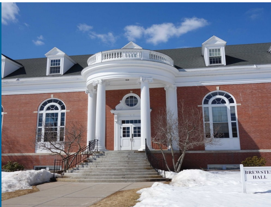
CEN Member Suffield Academy