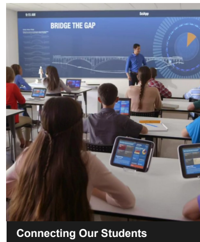
Connecting Our Students

Under the proposed budget for next year, CEN will begin billing schools and libraries for their use of the network starting in July 2016. Members that currently pay for access will see no immediate changes, and the network itself will remain substantially the same. In fact, guidelines governing federal funds used to expand the network in 2011 – 2013 require the network be maintained until at least 2024.