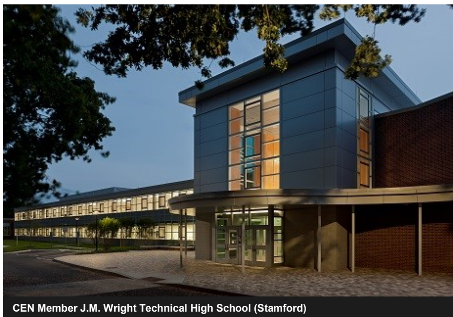
CEN Member J.M. Wright Technical High School (Stamford)

"We have been with CEN for about five years now and not only has the service been phenomenal, but the price decreases each year have been wonderful. You have reduced the Mb/month rate by more than 50% just over the last year."